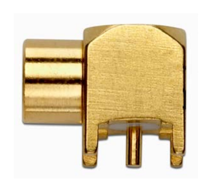
Model 73008 MCX JACK R/A PCB RECEPTACLE